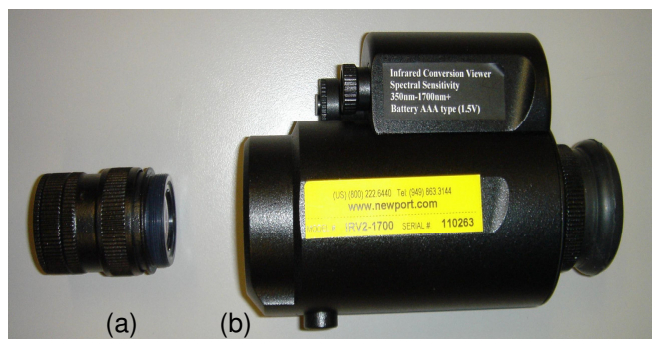
Figure 2. (a) 1x lens and (b) IR viewer

The adapter is not required for use with the 1x lens. Screw the threaded side of the 1x lens into the IR viewer as shown in Fig 2.