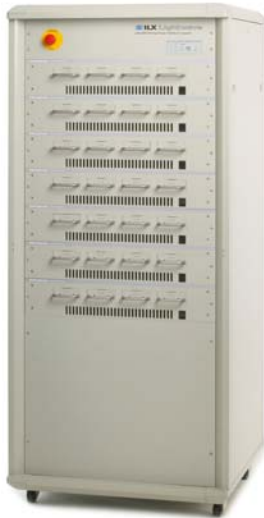
Figure 1. LRS-9550 High Power Test System

The LRS-9550 High Power Test System uses high performance water-cooled cold plates to achieve fixture temperatures of as low as 25°C under full thermal load. Good water quality is critical in water-cooled systems to prevent corrosion and scale buildup, which can degrade performance and cause cooling system failures. This technical note provides water quality guidelines designed to maximize lifetime of the LRS-9550 cold plates.