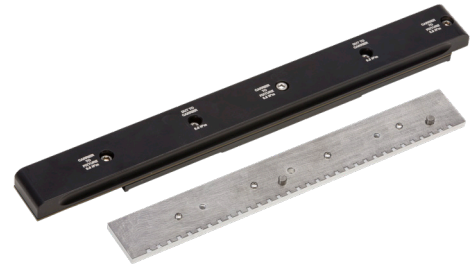
Expanded Integrated Carrier Solution (ICS) with up to 32 individual device mounting locations