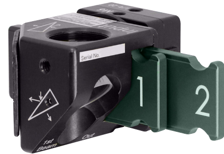
LBP2-SAM mounted on an LBP2 laser beam profiler

improve the accuracy of beam width measurements.